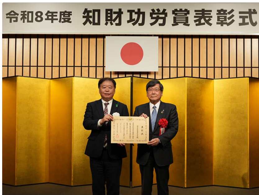
At the award ceremony

Honored for Establishing a Sustainable Genetic Resource Development Framework through Partnerships with Provider Countries