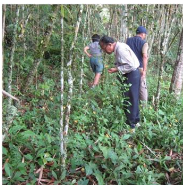
Joint exploration and evaluation of genetic resources in Indonesia

SunPatiens®, which was developed using genetic resources jointly explored with the Government of Indonesia, is marketed globally under a unified brand name and has earned a strong reputation worldwide. Cumulative global sales have exceeded 700 million plants, and the product marks its 20th anniversary since launch this year.