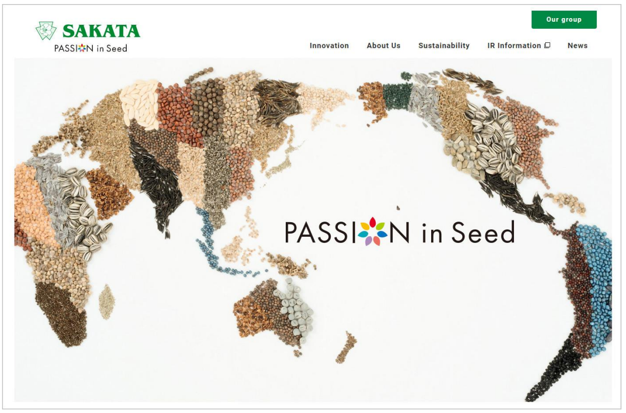
Top page of the "SAKATA Group's Global Brand Website"

Sakata Seed Corporation has newly opened the "SAKATA Group's Global Brand Website" (https://global-sakata.com) to deliver the latest information on the group's global businesses to diversifying stakeholders across the world.